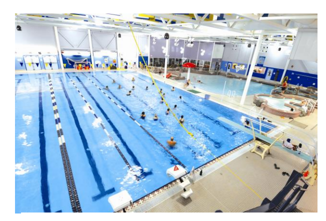
Cranbrook Aquatic Centre

COVID-19 UPDATE Our building is currently City of Cranbrook closed to the public. Recreation and Cultiplease make an appointment to pick-up Cranbrook, BC V1C 7G Transit passes.